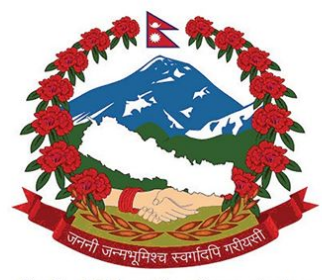
Medical Education Commission

Note: Foreign (Indian) students who have qualified NEET with atleast 50 Percentile in same academic year can take direct admission in Nepal, No need to appear for exam of Nepal. However, it is compulsory to fill online form of MECEE & choose Category B who want to take direct admission in Nepal.